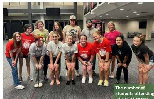
The number of students attending D&E BCM nearly doubled in the spring semester.

We became an official student organization during this semester and hosted a candy outreach event in March. Several students also served at a prom for students with special needs. D&E BCM ended the semester strong with an ice cream sundae bar and country line dancing. Overall, it was a great first semester on campus, we have a strong and dedicated leadership team, and we are prayerfully looking towards God's plans at D&E.